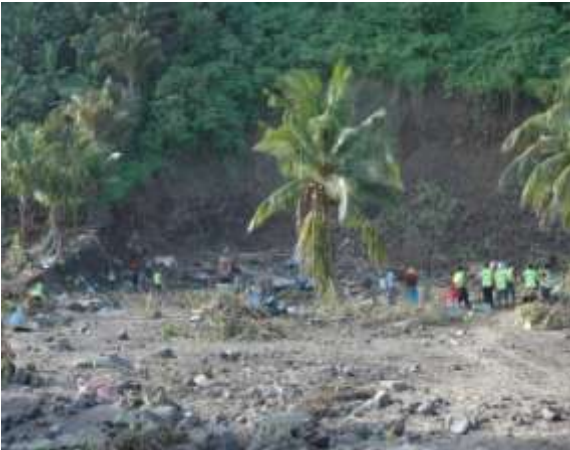
Destruction – scoured landscapes