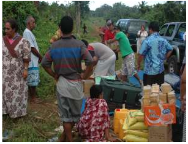
Food supplies for the relocated communities