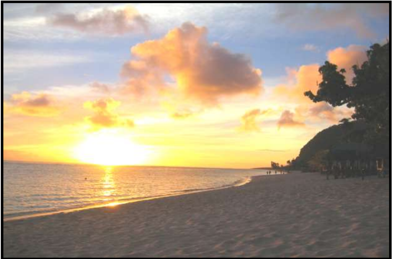
Sunset Lalomanu Beach 2009

An account of the tsunami disaster, the response, its aftermath, acknowledgement and the trek to recovery.