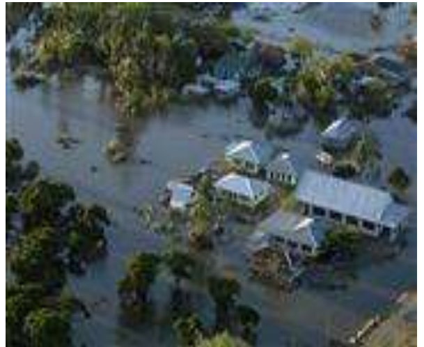
Destruction – salt water intrusion into soil