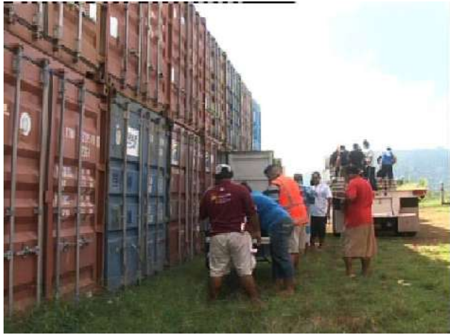
Containers upon containers relief supplies