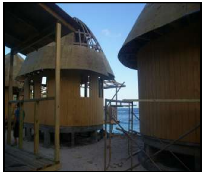
Rebuilt beach fale operations Lalomanu