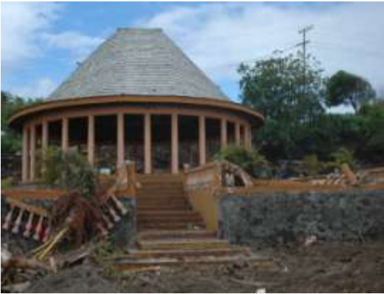
Destruction at Lepa – Samoan architecture withstood tsunami