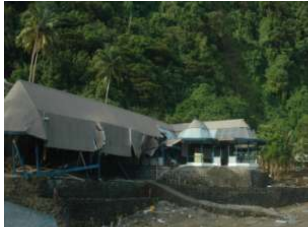
Destruction – homes folded like paper toys