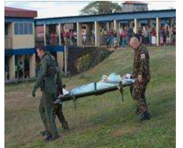
NZ medics bring in the wounded