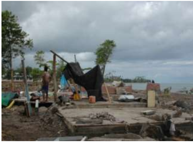
From makeshift shelter to .....