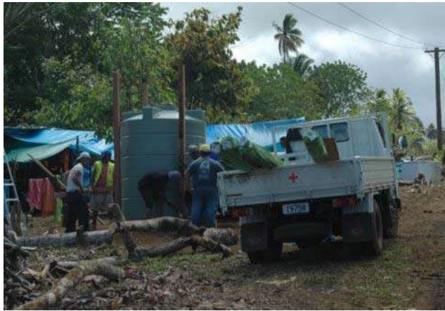
From interim water supplies to .....