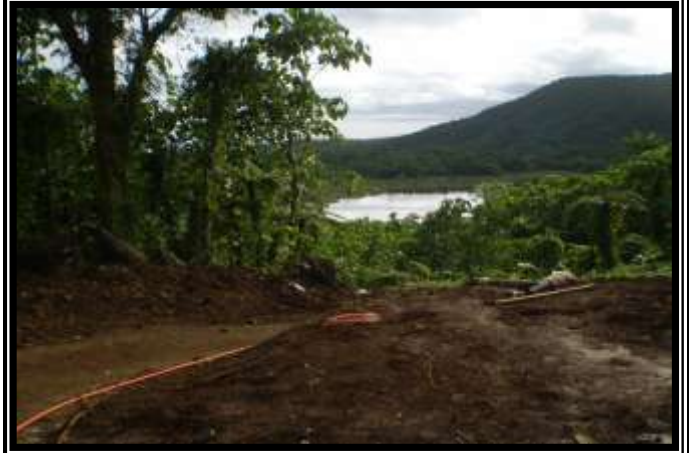
...new water supply schemes – Lake Lano