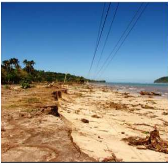
Destruction – beach erosion