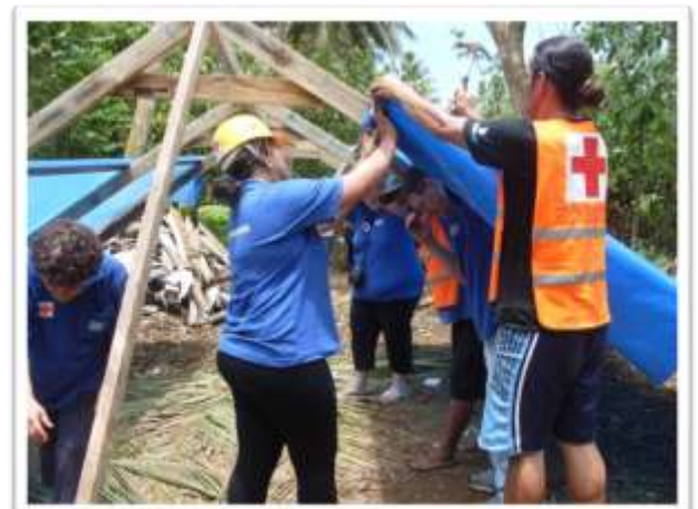
Red Cross provides temporary shelter