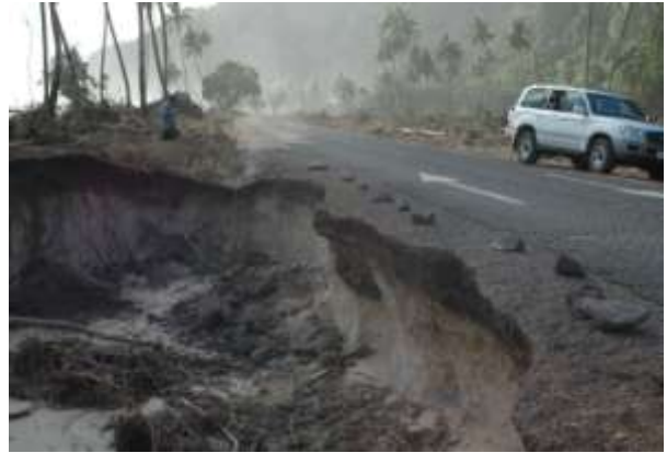
Destruction of road networks