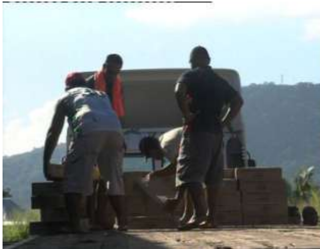
Volunteers at work – daily food distribution