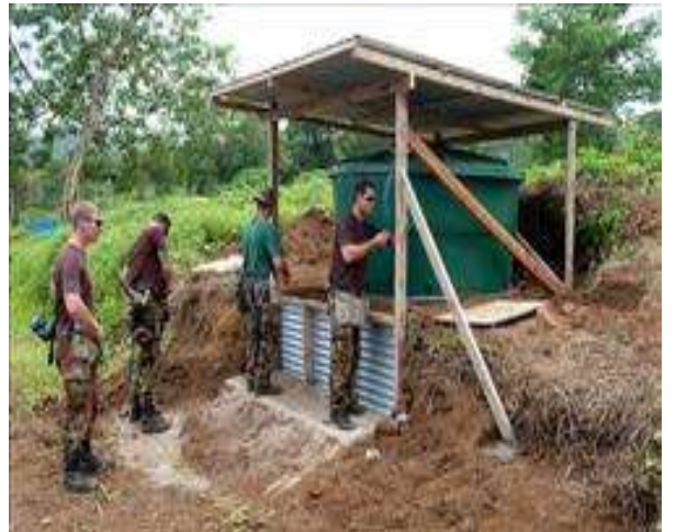
NZDF provides water purifiers