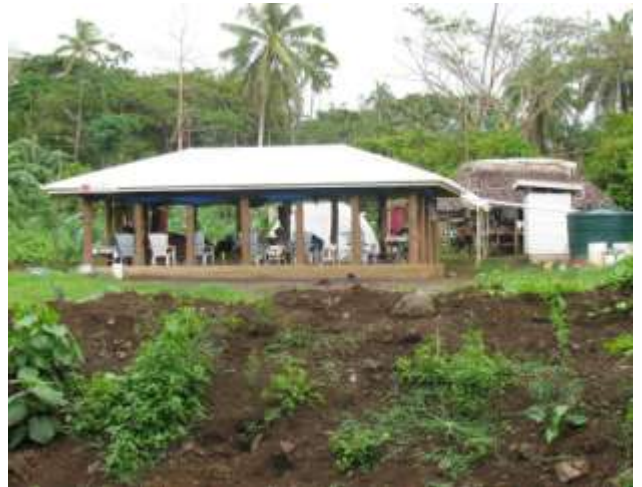
.....permanent homes & amenities