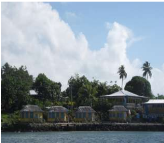
Rebuilt Sweet Escape fales Manono